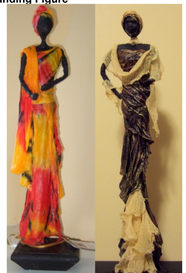
Examples using scarf and broom skirt

THE DRESSES will be done with transparent Paverpol and colored cotton material (not Provided) which can be from old cotton "broom skirts", scarves or other light bright cotton prints. You will have the option of either a smooth or sculpted face (provided).